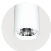
W Snow White W Snow White