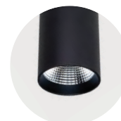
B Jet Black B Jet Black