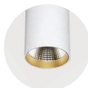
W Snow White G Satin Gold