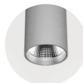
S Radiant Silver S Radiant Silver