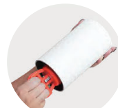
Optic Removal Tool for clear cover