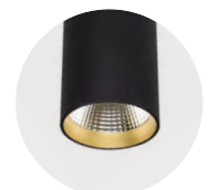
B Jet Black G Satin Gold