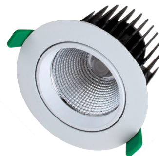
Model : F30CRD